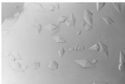
Figure 1 Crystals of snake gourd seed lectin (form II).

tively. Crystal form I was obtained by the hanging-drop method by equilibrating a 10 µl drop of 10 mg ml -1 protein in the presence of 4 mM lactose in 0.02 M phosphate buffer pH 7.0 containing 0.1 M NaCl